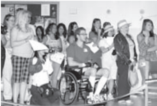
The crowd at the open-house was impressed by CCI's highly-trained assistance dogs.