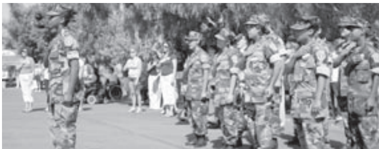
The Camp Pendleton Young Marines pledged allegiance before the start of the festivities.