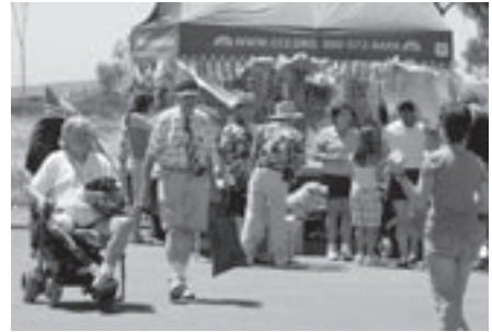
The CCI Salutes Independence event drew almost 400 people, both military and civilian.

This massive event required the help of 45 individual volunteers, along with groups from the Camp Pendleton Young Marines, the National Charity League and the Rancho Bernardo Lions Club. CCI could not have conducted this important outreach effort without the help of so many dedicated supporters. Thank you for all of your hard work!