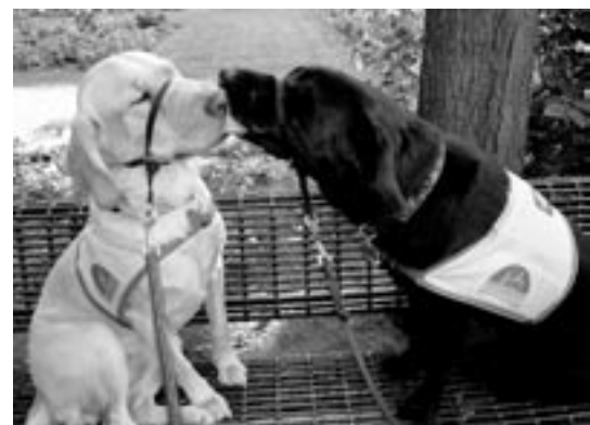
Puppies in Program Tanny and Filia enjoy their field trip to Lagoon.

September and October will also be a very busy time for the chapter as we attend 10 different events to educate our local federal employees on CCI. We hope they will choose CCI as a recipient for donations to the Combined Federal Campaign. If you are interested in vol-