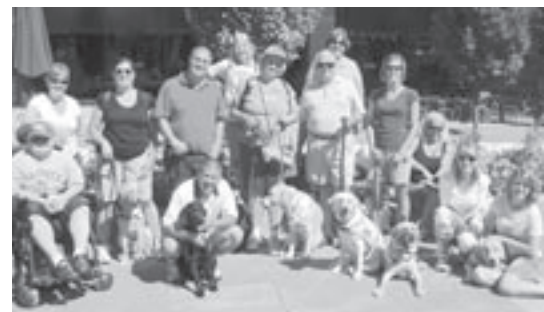
Volunteer puppy raisers gather to ride the light rail together in downtown Denver.

The Colorado office had a busy summer. Events included the Colorado Wyoming Petroleum Marketers Association's 12th annual Glen & Lynn Ann Balenseifen Memorial Golf Tournament at the Rolling Hills Country Club in Golden, which raised over $26,000; the 18th annual Good Times Car Show at Bancroft Park in Old Colorado City, which raised over $4,000; and the 6th annual Journey to Independence event in Cordillera, which raised over $130,000. A big CCI THANK YOU to all of the volunteers and supporters who helped make these events so successful!