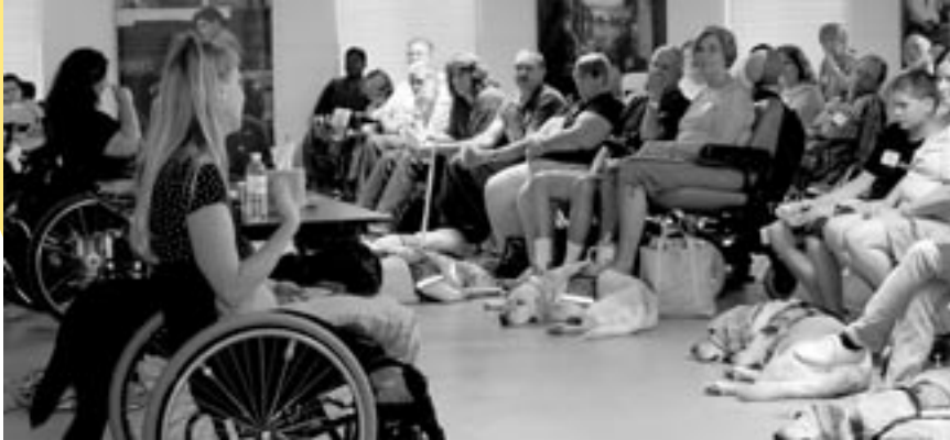
Graduates fill the training room for a presentation at the 2009 Graduate Workshop.

On July 18, 2009, approximately 50 graduate teams from across the Southwest Region gathered at the Dean, Gerda & Trixie Koontz Campus in Oceanside, California for the annual Graduate Workshop. Instructors, graduates and other experts gave presentations and demonstrations on topics ranging from travel with assistance dogs to doing outreach for Canine Companions. Attendees especially enjoyed the advice given by a canine dental specialist. At the end of the day, teams with special concerns were also invited for one-on-one sessions with instructors.