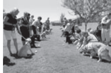
Arizona puppy raisers treat their charges to a Frosty Paws party before matriculation in August.