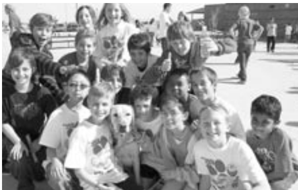
Ryan Elementary School students gather around CCI puppy in program, Chapman, at the school's "Fun Run" that benefitted CCI.