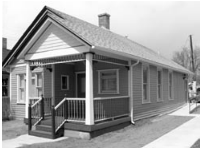
The new headquarters building for CCI Colorado—126 East Las Animas Street, Colorado Springs, CO, 80903.

● 11th Annual Balenseifen Memorial Golf Tournament This exciting tournament, sponsored by the Colorado Wyoming Petroleum Marketers Association, will take place at The Club at Pradera in Parker on June 9.