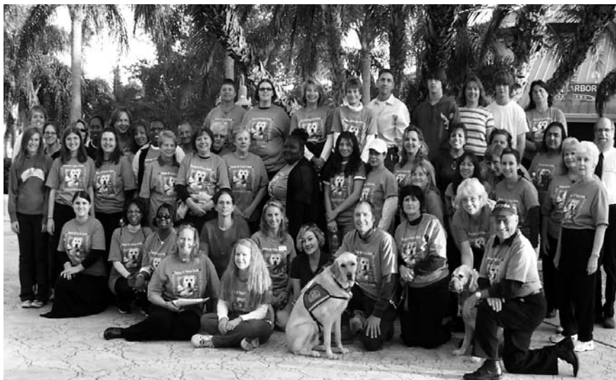
2007 Tales & Tails Gala Volunteers