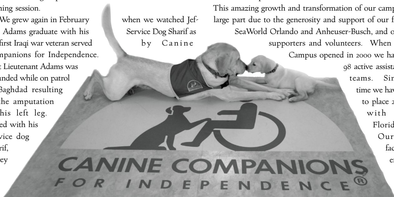
Rossie II meets Gracie V at the Southeast Regional Center