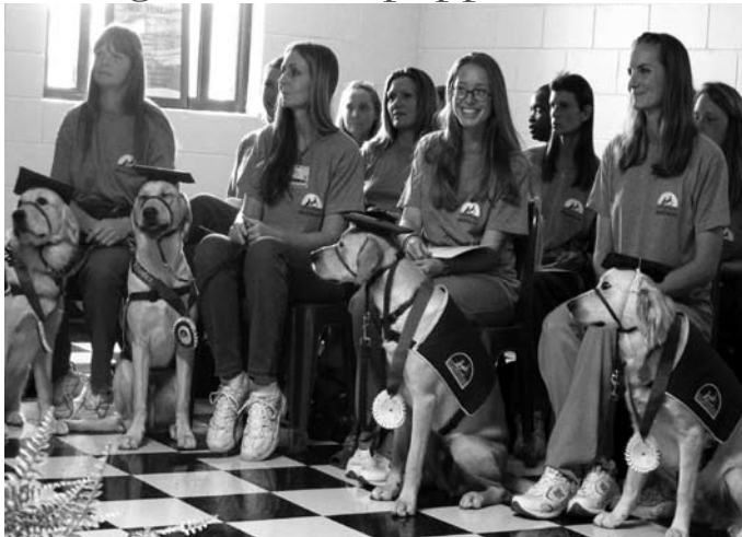
Gadsden Correctional Facility

Gadsden Correctional Facility Inmates Raise $ 2,587.00 for Canine Companions for Independence.