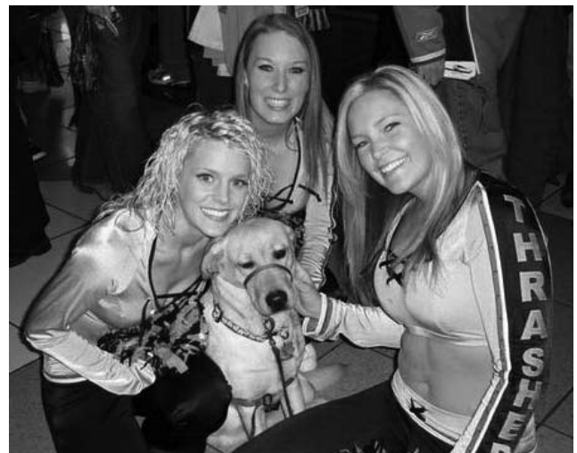
Thrashers Cheerleaders with Bracca

In January, the Atlanta Thrashers Hockey Team hosted a successful 50/50 Raffle fundraising event at Philips Arena in Atlanta, Georgia