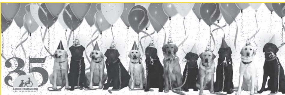
Pictured: May Graduating Class 2010

Don't miss out on this amazing evening! Please join with us in celebrating CCI's 35th Birthday. To find out more on how you can join CCI in the celebration and become part of its history go to www.cci.org/heartsandheroes2010 .